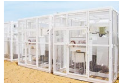
TRANSFORMERS AND SWITCHGEARS