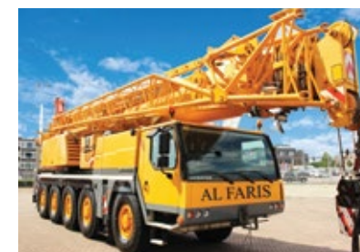
ALL TERRAIN CRANES