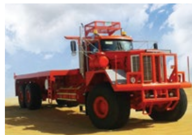
RIG TRANSPORT PRIME MOVERS