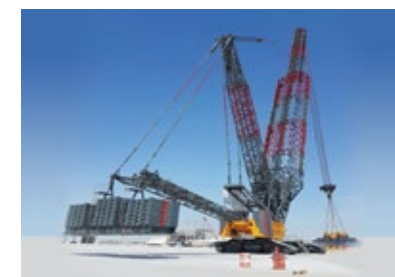
LATTICE BOOM CRAWLER CRANES