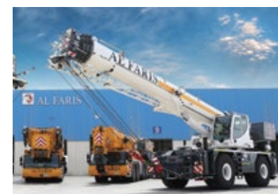
ROUGH TERRAIN CRANES