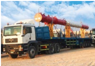
LOW BED & FLAT BED TRAILERS