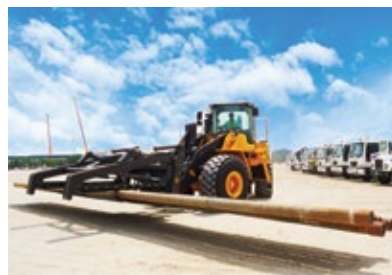
WHEEL LOADERS WITH SPECIAL ATTACHMENTS