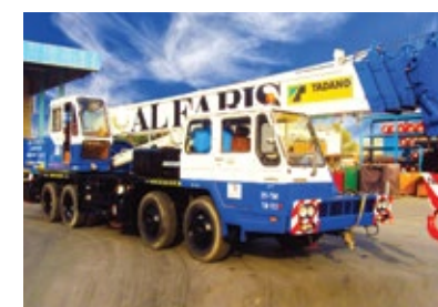
TRUCK MOUNTED CRANES