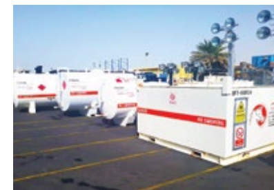
BUNDED AND CYLINDRICAL FUEL TANKS