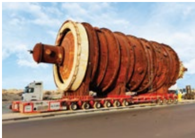
SELF PROPELLED MODULAR TRANSPORTERS (SPMT'S)