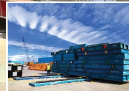
SKIDDING SYSTEM - MODULAR PUSH & PULL UNIT