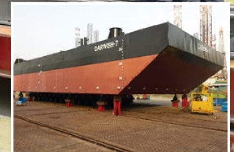
EVO SERIES SYNCHRONOUS JACKING SYSTEM